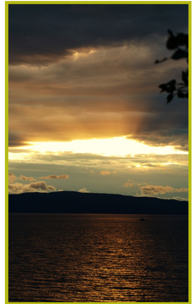
Photo: Red Rocks, Burlington, VT.