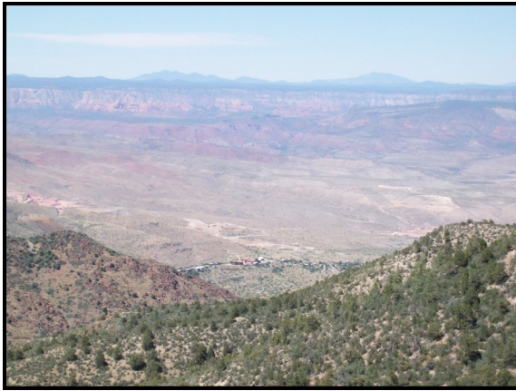
View of Prescott Valley, AZ from Hang Glider Trail on Mingus Mountain. Photo from ENSC undergraduate Ashley Murphy, story page 10