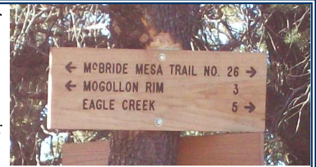
Mesa Trail sign, Apache-Sitgraves Forest, AZ

My internship with the Coconino Rural Environment Corps, though focused on hiking trails and not actual community sustainability practices, has certainly enlightened me and sparked my interest in ecological design. Previously unsure of where my future lay as an Environmental Science major, I now hope to choose a focus in ecological design. My internship left me not only with memories of the beautiful landscape of Arizona, but also with an initiative to change how communities interact with the environment.